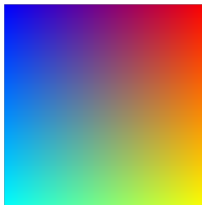
Figure 3: RGB spectrum example.