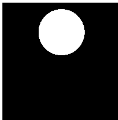
Figure 2: Binary circle example.

Think of a formula describing the circle with respect to pixel coordinates. Make yourself familiar with np.meshgrid .